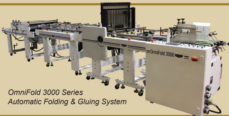
OmniFold 3000 Series Automatic Folding & Gluing System